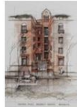
New York Real Estate Brochure Collection