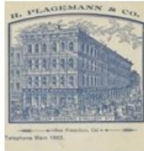
Biggest Collection of Architectural Vignettes