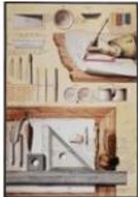
Andrew Alpern Collection of Drawing Instruments